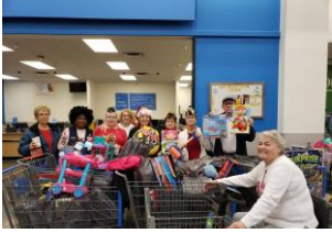
The Branch and Unit went Toys for Tots shopping