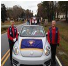
The Unit had a great time being in the Goose Creek Christmas parade