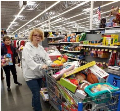
They really loved shopping for Toys for Tots