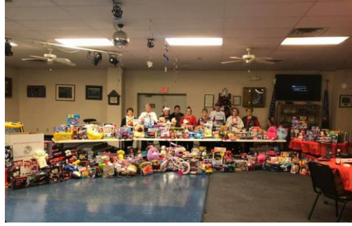
After the shopping trip Branch and Unit posed with a picture of the 372 toys. Thanks to all members that donated to buy these toys. Will have to work to beat this year's donations