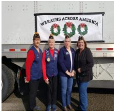
Unit 269 participated in the Wreaths Across America at the Carolina Memorial Cemetery