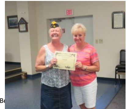
Be appreciation from Friends of Our Troops