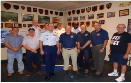
Coasties at the Coast Guard Cake Cutting for the Coast Guard 240 th Birthday. Active duty members also attended.