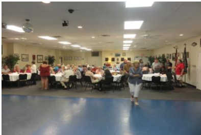
Many members were in attendance at the 10 th Anniversary of the Branch Home Celebration.