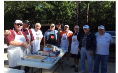
The Cooks taking a break at the annual SUBVET/FRA picnic