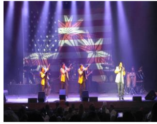
The Miracles performing at the VA sponsored Vietnam Veteran's Welcome Home.