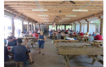
Everyone enjoying the fellowship and great food at the SUBVET/FRA picnic