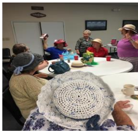
Widows Annual Tea at the Fleet with Unit 269 and Branch President