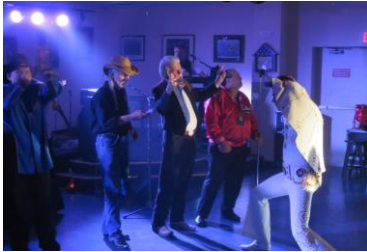
Elvis, Garth Brooks, Willie Nelson and Kenny Rogers performing at the Fleet