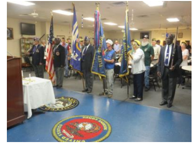
Historic Chapter of the Order of the Purple Hearts provided the color guard for the Memorial Service.