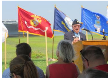
Medal of Honor Recipient speaking at the ground breaking of the Gold Star Family Monument