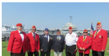
Four Marine Branch members with Medal of Honor Recipient Hershall "Woody" Williams at the groundbreaking