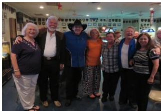
Some of the ladies enjoying the evening with Kenny Rogers and Garth Brooks