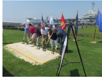
Ground Breaking at Patriot's Point for the Gold Star Family Monument